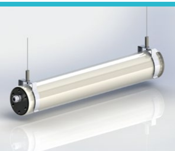
DL-SEAL suspended on adjustable cables