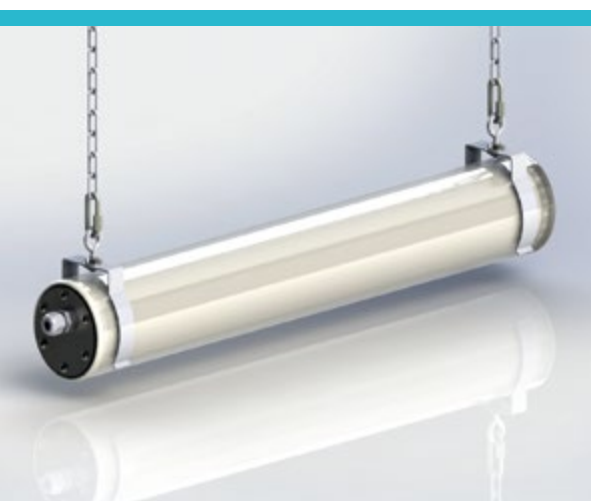
DL-SEAL suspended on a chain